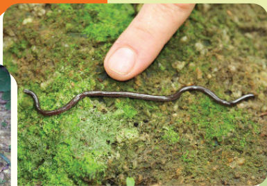
Common Blind Snake ( Ramphotyphlops braminus )