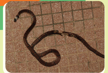
Coral Snake killed after entering a residential area

In Hong Kong, there are increasing encounters between humans and snakes. The Hong Kong Police receive enquiries from the public about snakes found in residential areas, gardens and houses. They provide a service to deal with snakes and KFBG experts work closely with the Police and hospitals by providing identification, rescue and general advisory services.