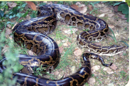
Burmese Python ( Python bivittatus )

The largest snake in Hong Kong is the Burmese Python (3.7 m on average) and the smallest is the Common Blind Snake (10-15 cm on average).